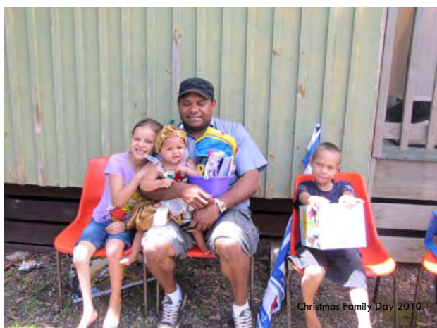
Christmas Family Day 2010