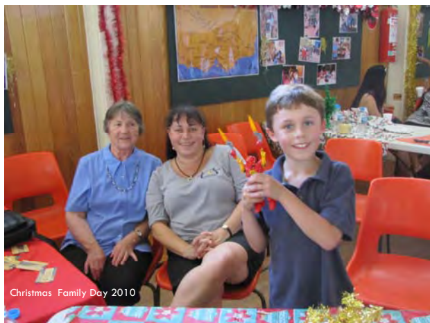
Christmas Family Day 2010