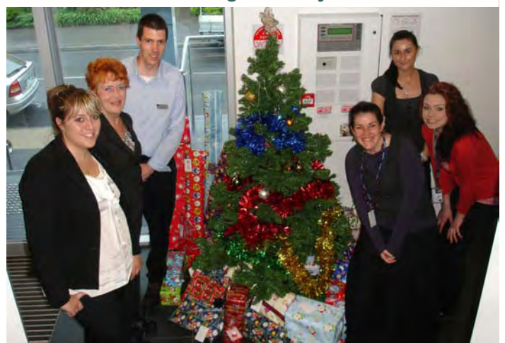
DoJ Staff with their generously donated Gifts