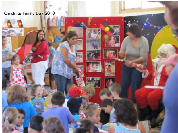
Christmas Family Day 2010