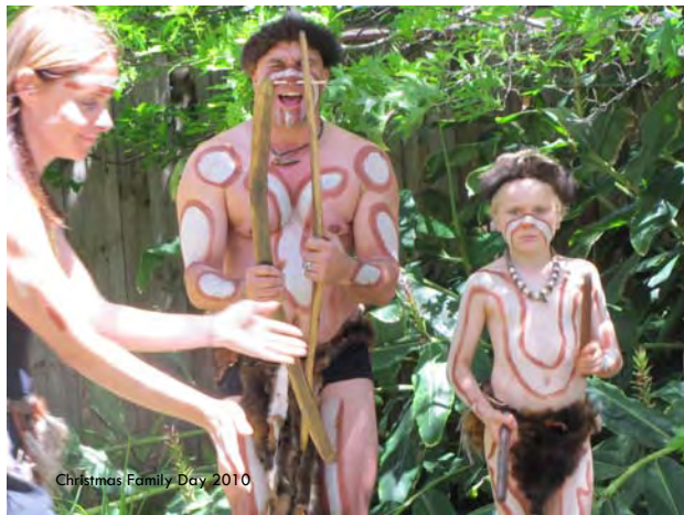
Christmas Family Day 2010