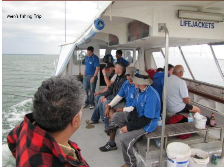
Men's fishing Trip