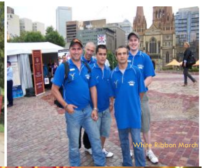
White Ribbon March