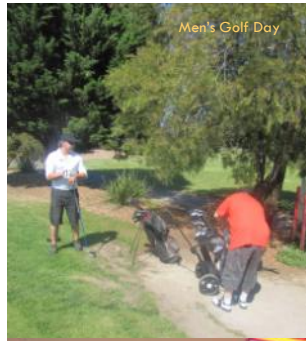
Men's Golf Day