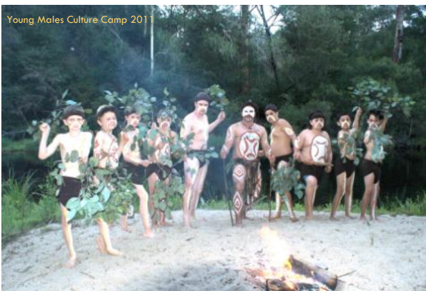
Young Males Culture Camp 2011