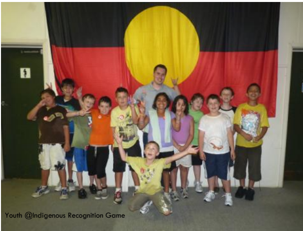
Youth @Indigenous Recognition Game