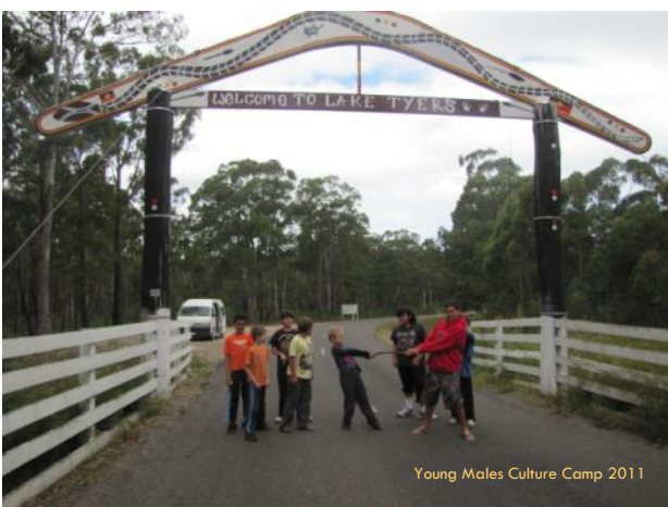
Young Males Culture Camp 2011