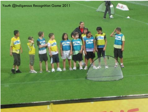
Youth @Indigenous Recognition Game 2011