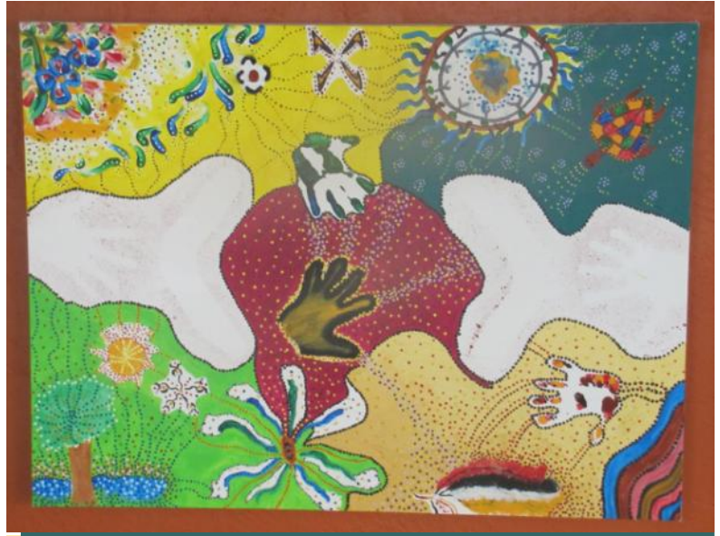
MMIGP Staff painting

On the 17/02/2011 at 47 Patterson St, Ringwood East we had a night session from, 6pm to 9pm, where we screened "The Women of the Sun" series part 1, I hope to have conversations around with the women in regards to what up coming activities they would like to do. This night time activity is for a trial period of 3 months, to see if we are able to maintain attendance and increase numbers.